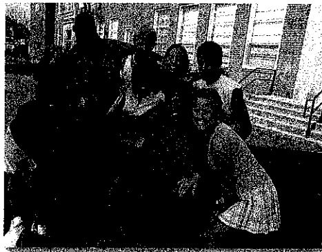
Visual Vocabulary diversity

persecution cruel treatment on the basis of religion, race, ethnic group, nationality, political views, gender, or class