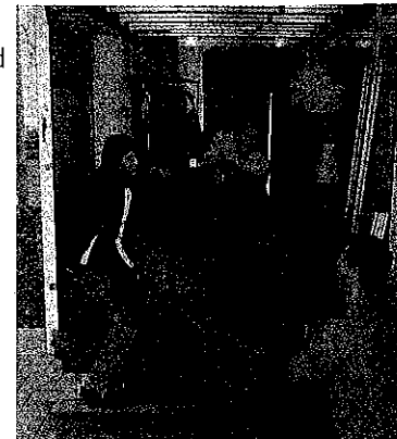
Moving Day About 112 million Americans relocate every year.

Have you ever moved from one part of the city or town where you live to another? Maybe you moved to be closer to your school or to where a parent works. It may be that one of your parents took a job in a different city. Perhaps your family had to move to a different climate for health reasons. Whatever the reason, moving to a new, unfamiliar area could change your life in many ways.